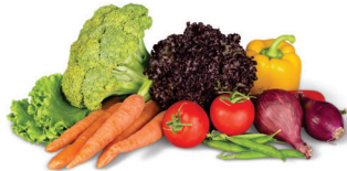
Veggies and Veggie Starts