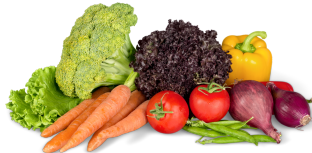
Veggies and Veggie Starts