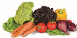
Veggies and Veggie Starts