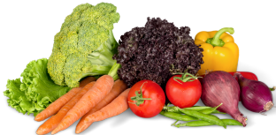
Veggies and Veggie Starts