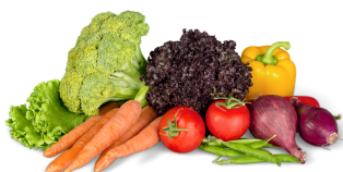
Veggies and Veggie Starts