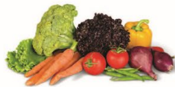
Veggies and Veggie Starts