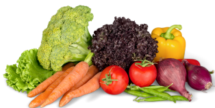
Veggies and Veggie Starts