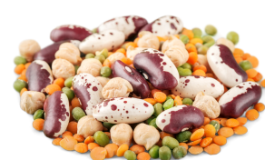
Lentils, Beans, & Peas