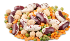
Lentils, Beans, & Peas